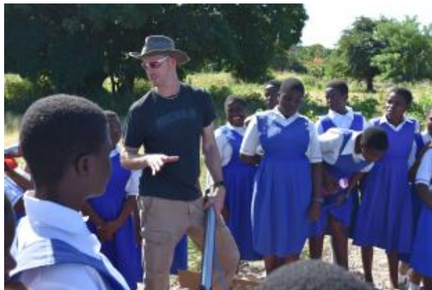
2 - Students at the school