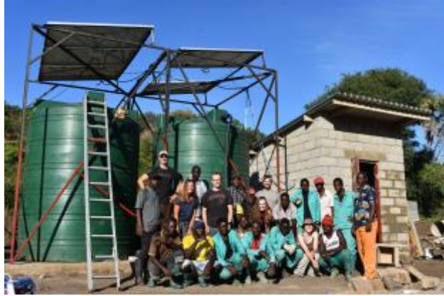
1 - Working on the project: UP students and their Malawian counterparts