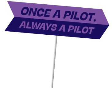
Photo Props for Commencement