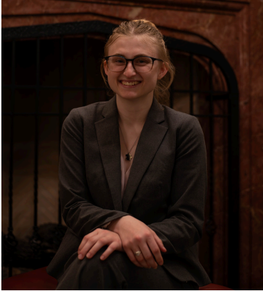
Rising Junior Treasurer