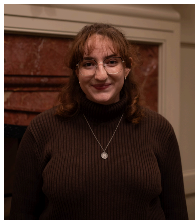
Rising Sophomore VP of Outreach